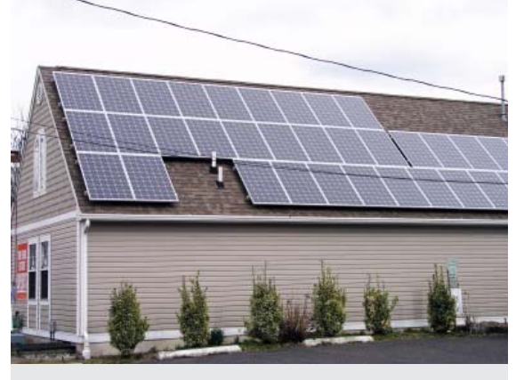
Recent changes to Pinelands rules provide a mechanism to speed the development of accessory solar energy facilities such as the one above.

■ Stipulate special limitations that apply to solar energy facilities installed as a principal use in the Ag-