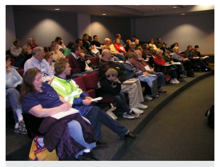
Last year's Pinelands Short Course attracted more than 600 people.