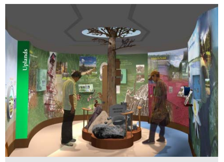
The exhibits shown above feature sculptures and interactive displays that highlight the region's geology, uplands, wetlands and surface waters.

Pinelands landscape, while exploring the dwarf pine and oak trees found in the Pine Plains, as well as the story of Elizabeth White and her efforts to cultivate the blueberry. The "wetlands" section would focus on rare plants and animals, such as the Pine Barrens treefrog, as well as cranberry agriculture. A large aquarium of native Pinelands fish would be featured in the "surface waters" section of the exhibit.