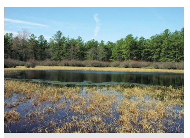
The Pinelands Commission will study the ecology of intermittent ponds such as this one in Burlington County

protection of these ponds and the important habitats they provide for